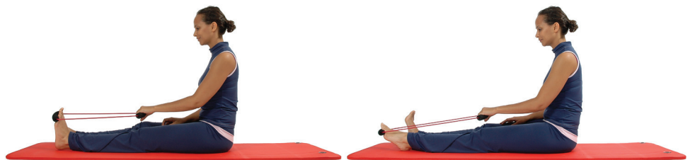
O-Ring - Leg Stretch

Sit down, stretch your leg, placing one o-ring handle behind your toes, while holding the other. Gently push your ankle down, as if you were in your car, stepping on the gas.