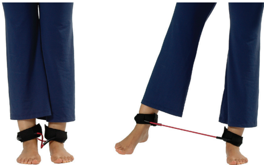
Cuff Ring - Side Sway

Attach the velcro cuff-rings to your ankles. Stand on one leg, pushing the other slowly outward. Keep a stable object nearby for support if needed.