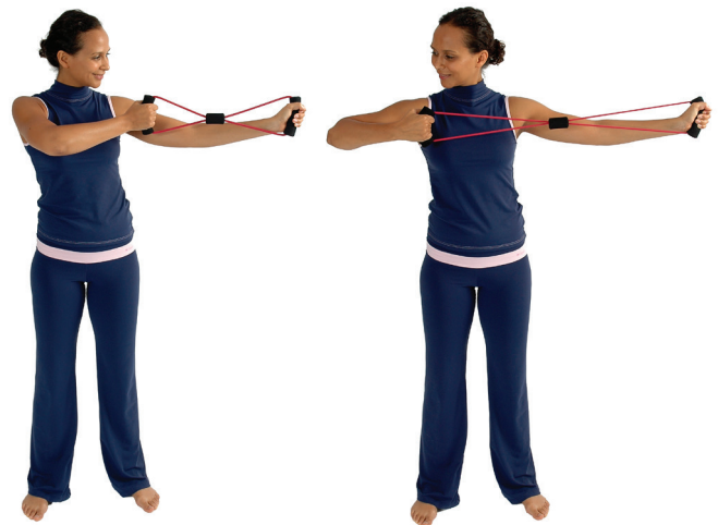
Figure 8 - Archer

Hold the Tube Loop to your side with one arm stretched. Pull the other arm away, mimicing the movement of an archer.