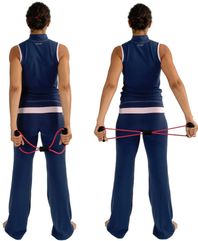
Figure 8 - Back Low

Hold the Tube Loop behind your back with your arms straight. Pull both arms outwards.