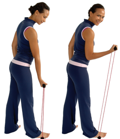
O-Ring - Arm Curl

Attach the velcro cuff-rings to your ankles. Stand on one leg, pushing the other slowly forward. Keep it there for a second and push it backward. Keep a stable object nearby for support if needed.