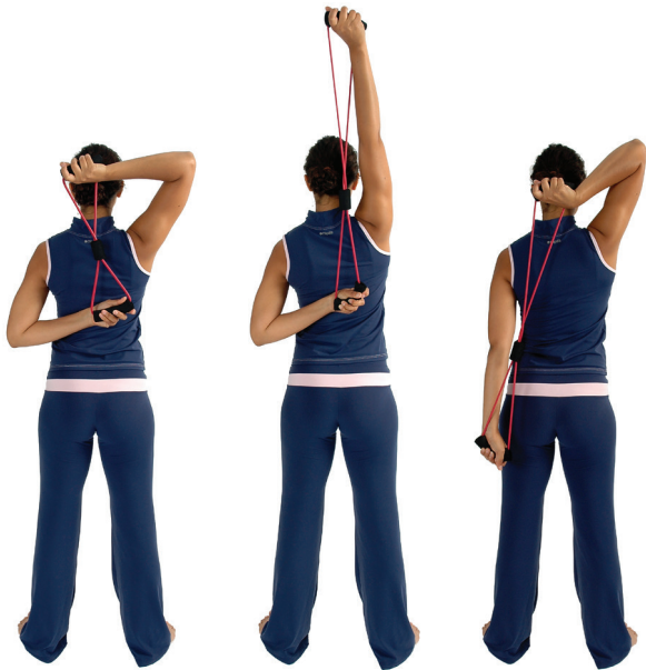
Figure 8 - Back Top

Hold the loop between your shoulder blades, parallel to your spine. Pull one arm up. After lowering it back to the starting position, pull the other arm down. After your repetitions, switch arms.