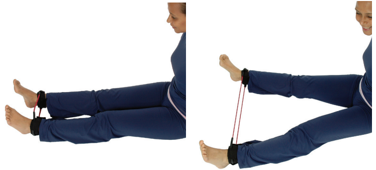
Cuff Ring - Sideways

Attach the velcro cuff-rings to your ankles. Sit down, stretching your legs forward. Push both legs slowly outward at the same time and return to starting position.