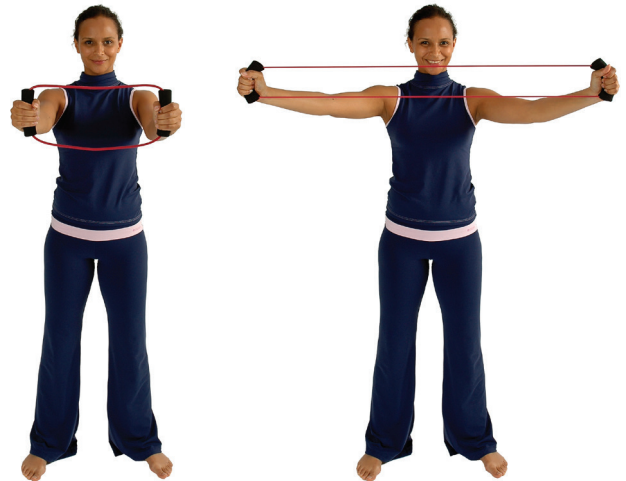
O-Ring - Horizontal Stretch

Hold both handles from the Loop in front of you and stretch it horizontally to the outside.