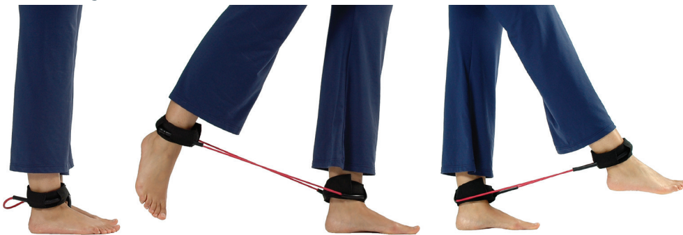
Cuff Ring - Foreward & Backward

More exercises on www.moves-band.com , f and y