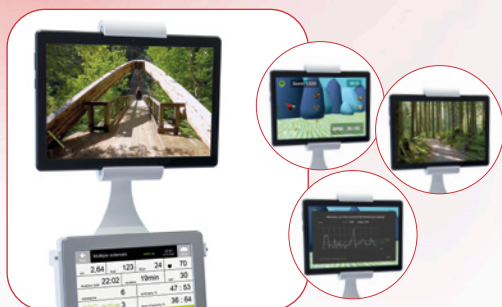
KINEVIA ENTERTAINMENT SYSTEM