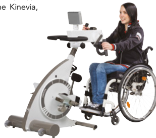
Kinetec Kinevia Duo™